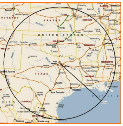
Fixed Wing Air Ambulance Service

6) CareFlite membership helicopter and fixed wing coverage areas are shown above. Ground Ambulance and/or 911 EMS service is covered and currently offered in portions of the following counties: Collin, Dallas, Denton, Ellis, Erath, Henderson, Hill, Hood, Johnson, Kaufman, Palo Pinto, Parker, Rockwall, Tarrant and Van Zandt. No service offered to/from Mexico.