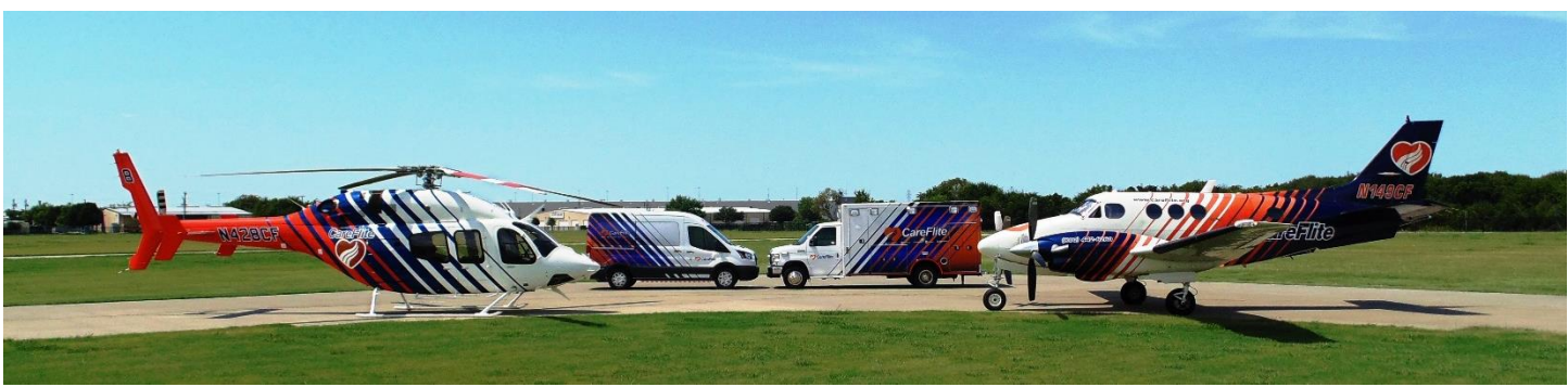
CareFlite: America's Oldest Joint Use Air Helicopter Fleet

If you have any questions about this program, please contact 3G Water Supply (325) 379-3682. For questions about CareFlite and this program, please call the Caring-Heart Member Services Office (877) 339-2273 during business hours.